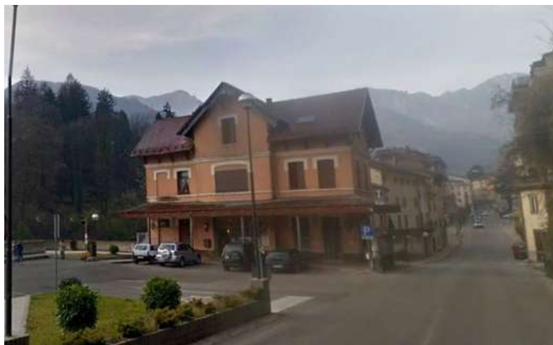
Recoaro Bus Station